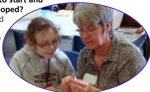
Creative Skills: Learning to Knit

Skippko was started by a dancer and a visual artist over 20 years ago, and initially ran from a garage! We then moved to Bramley, where we're still based. Staffing has ebbed and flowed