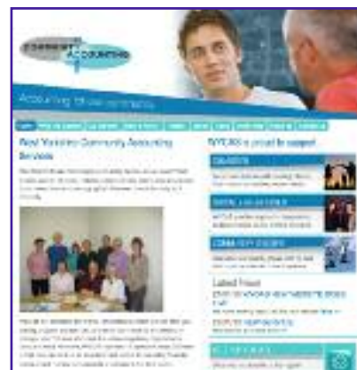
The new WYCAS website