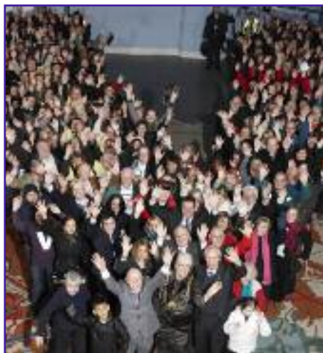
Volunteers at the launch of Leeds Year of Volunteering 2010

Due to the recession there are many people with a wealth of experience in finance work, who are ready and willing to help in your organisation. This can range from individuals with a finance degree, seeking relevant practical experience to those who have been made redundant. These volunteers are available at a variety of times: daytimes, evenings and weekends – so there is likely to be someone out there to suit your needs! Your local Volunteer Centre can provide you with contacts. Of course, it is advisable to interview and take up references for a